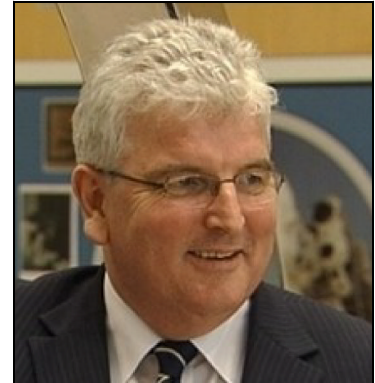
Former Defence Secretary Des Browne

Browne said the group hoped to provoke a similar debate in Britain, and a handful of members were in Washington to consult senators and members of the Obama administration. "These weapons are so dangerous, their power is so lethal, that comparatively small numbers, comparatively small developments will make the world a much less safe place than it currently is," he said.