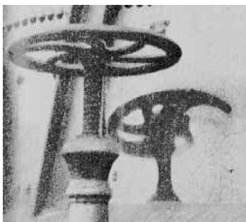
Engraved heat shadow at the moment of the Hiroshima detonation

On June 24, 1982, at the 2nd UN Special Session on Disarmament held at UN Headquarters in New York, then Mayor Takeshi Araki of Hiroshima proposed a new Program to Promote the Solidarity of Cities toward the Total Abolition of Nuclear Weapons. This proposal offered cities a way to transcend national borders and work together to press for nuclear abolition. Subsequently, the mayors of Hiroshima and Nagasaki called on mayors around the world to support this program.